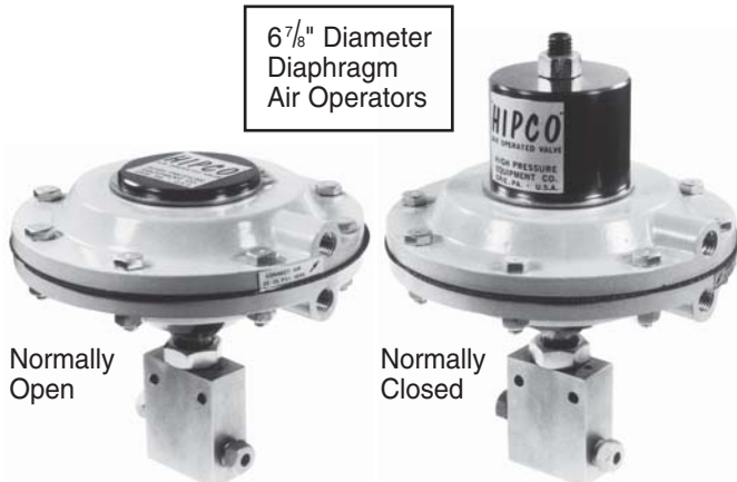
6 7/8" Diameter Diaphragm Air Operators

Temperature Considerations . . . Extended stuffing box for temperatures from -423°F to 1,200°F (medium and high pressure connections only)